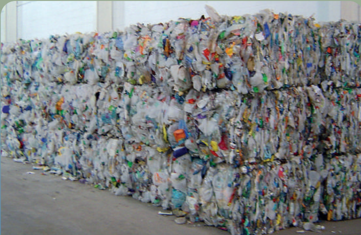
400kg bales of plastic bottles