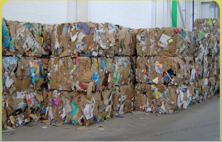
500kg bales of cardboard