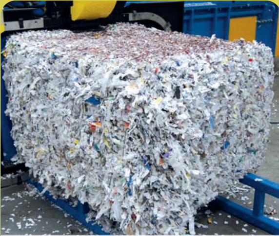
620kg bale of shredded paper