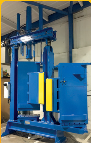
EasyBale Swivel Box

Upto 15 high density bales per hour 45-65kg