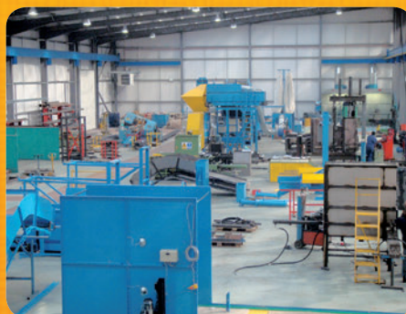
All components are fully assembled for final testing before delivery.