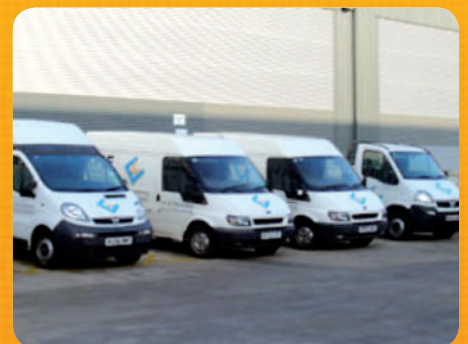
Full delivery and installation with after sales and backup support.