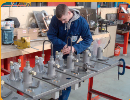
Hydraulic systems built for all applications, large or small.